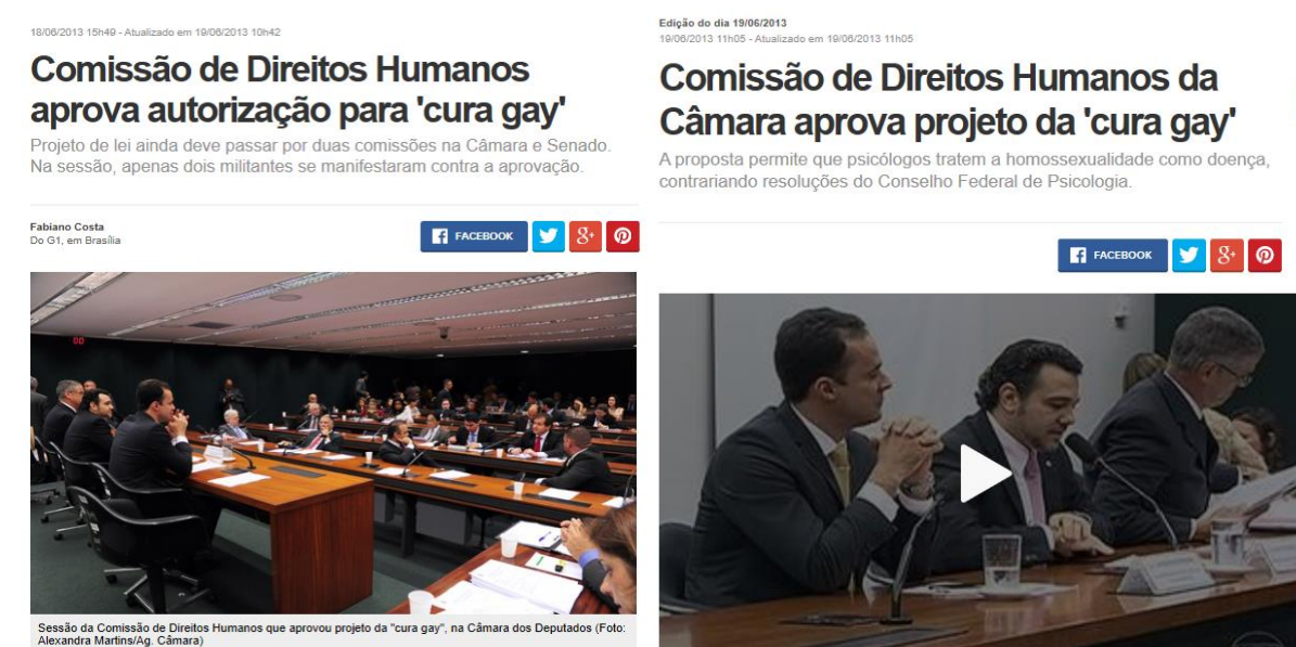
Figure 6 - Press spread the approval of the project “gay cure” by the Human Rights Commission.

With broad support from the evangelical parliamentary front, the parliamentary front in defense of the family - headed by the then senator Magno Malta - and from the Catholic bench, the project passed through the Chamber's Human Rights Commission until 2013. It became widely known as “gay cure project” (Figure 6).