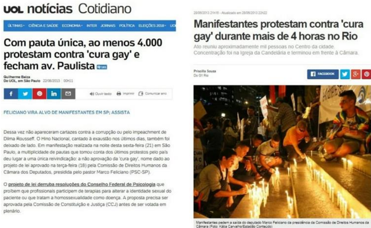
Figure 7. Newspapers bring headlines of the opposites protests to the “project gay cure”.

Upon gaining visibility, the debate was not restricted to the halls of the Chamber of Deputies. Discussions about the “gay cure” won the streets and social media. Driven by the political change movement that later became known as “Jornadas de Junho”, protests across Brazil gained strength calling for the archiving of the “gay cure project” (Figure7).