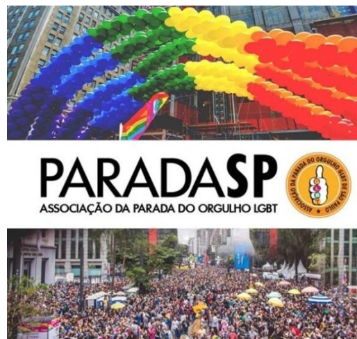
Figure 5 - Propagation of LGBT Pride Parade from SP considered the biggest parade of the country.

With greater visibility, in 1995, the 17th Conference of the International Association of Lesbians, Gays, Bisexuals, Trans and Intersex took place in Rio de Janeiro, with a small march at the end, which motivated the emergence of a larger movement that became known as “Gay Pride Parade”, later updated to “LGBT Pride Parade”. Currently, the event is national and receives millions of people in various states of the country, who together take to the streets to expose the existence of LGBT+ identities, claim public policies aimed at sexual minorities and fight against prejudice (Figure 5):