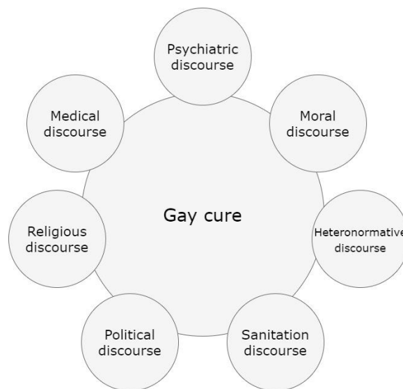
Figure 10 - Discursive plot of “gay cure”.

the idea of “cure”, which will become a social rule of the group and imposed on homosexual individuals (Figure 10):