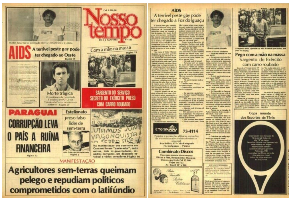
Figure 3 - Newspaper new HIV/AIDS as “gay plague”.

However, with the HIV/AIDS epidemic in 1980, LGBT+ movements around the world suffered from the countless cases of infected gay men, which led to a political resignification of the movement in dealing with yet another label from the community. Homosexuals have the stigma of having a disease that could plague society at the time, newspapers reported the HIV/AIDS epidemic as “the gay plague” (Figure 3).