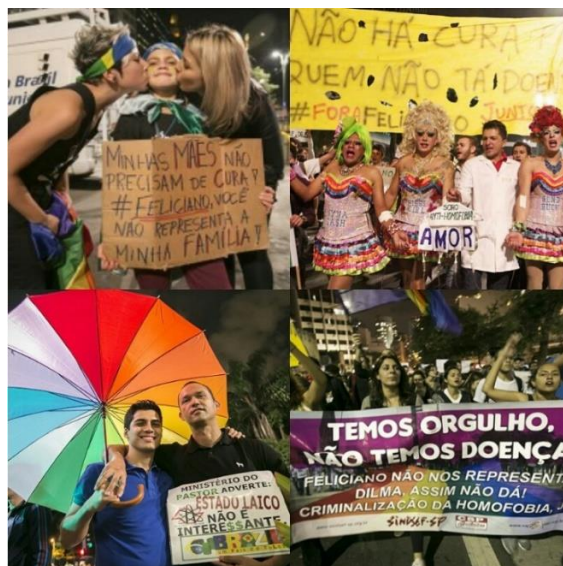
Figure 8 - Protesters on streets against the PDC 234/11.

The protests called for the termination of PDC 234/11 and criticized Deputy Marco Feliciano, chairman of the Human Rights Commission. The demonstrations also brought a character of struggle for LGBT+ movements to recognize their identities. Posters and speeches carried statements against the political onslaught of "gay healing" and reaffirms that homosexuality is not a disease. The images below portray this movement of the streets towards the end of PDC 234/11 (Figure 8).