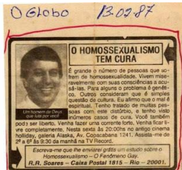
Figure 4 - The missionary advertising R. R. Soares propagating the homosexuality cure.

Note: It's reads "A God's man who fights for you/The homosexuality has cure: It is big the number of people who suffer of homosexuality. They live miserably with your consciousness accusing them. To some of them, the problem is genetic. Others consider it as a culture issue. I say that the evil is spiritual. I have treated many people with this disturb, and I have seen countless healing case. You can also be freed. Come make a strong current. Come became free completely. This Friday, at 8p.m. in the old cinema Holliday, Alaska gallery, Copacabana Avenue 1241. Watch me from Monday to Friday, at 9:30p.m. on TV Record. / Write me and I'll send you free a study about Homosexuality – The Gay Phenomenon."