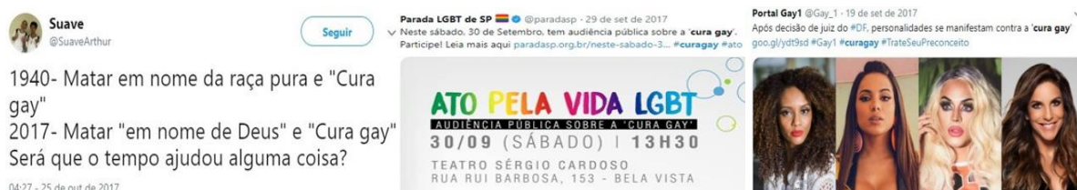
Figure 9 - Manifest contradicts the "gay cure" on Twitter.

Note: In the first picture, it is reads "1940- Kill in the name of pure race and 'gay cure'/2017- Kill 'in the name of God' and 'gay cure'/Did time help anything?". In the second picture, "On this Saturday, has a public hearing about the 'gay cure'. Participate!/Act for LGTB life". In the third, "After the judge decision of #DF, famous manifest against the 'gay cure'".